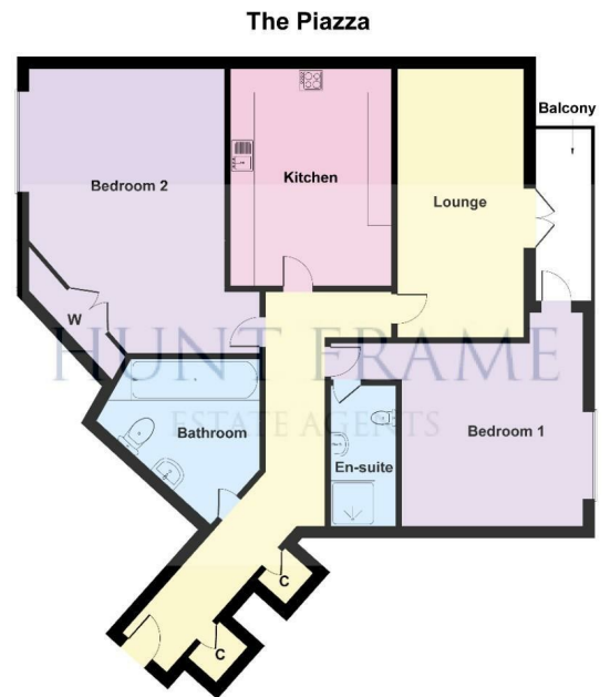
Not to Scale. Produced by The Plan Portal on behalf of Hunt Frame. For Illustrative.